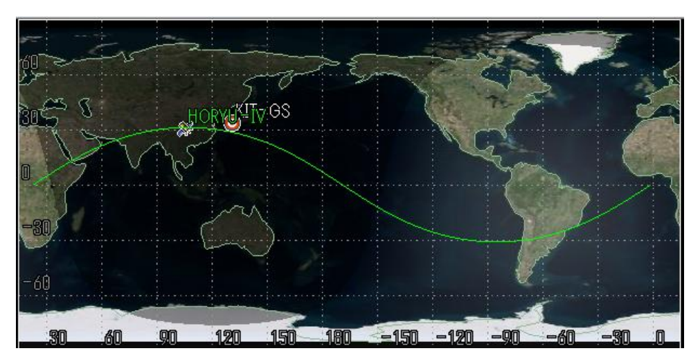
Figure 3 HORYU-IV first contact with KIT-GS

The KIT-GS will establish contact with HORYU-IV during 13 minutes from 19:27:50 (JST) / 10:27:50 (UTC) to 19:40:50 (JST) / 10:40:50 (UTC). Figure 3 shows STK simulation of HORYU-IV while orbiting over KIT-GS.