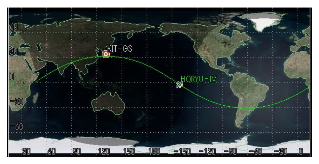
Figure 2 HORYU-IV location at separation (orbit altitude: 573km, inclination: 31deg)

Figure 2 shows the location of Kyushu Institute of Technology ground station (KIT-GS, latitude: 33°53'28"N and longitude: 130°50'26"E) relatively to HORYU-IV location at separation. Assuming the launch occurs at 17:45 (JST), HORYU-IV will start orbiting at 18:17:38 (JST) / 9:17:38 (UTC), and from STK analysis results, it will take 1 hour and 10 minutes for the satellite to make its first contact with KIT-GS.